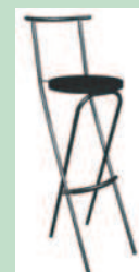
S33 black 16,25 €