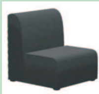
S23 Modulo sillón black