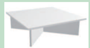
E5 table cruceta White