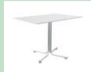
Me 23 rectangular table white