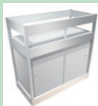
MO4 Show case counter white