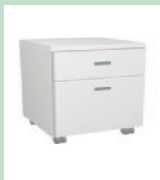
C5 Buch 2 drawers