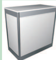
Mo1 Counter white