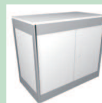
Ma1 Cupboard White