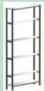
E6 group of horizontal shelves white