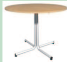
M10 Round table black white beech