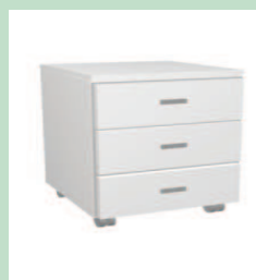
C6 Buch 3 drawers