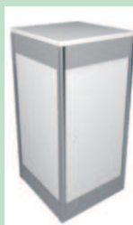
E4 podium 75cm White