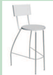
S29 transparente 18,63 €