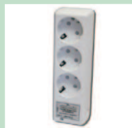
Single phase triple plug (max1000W)