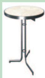
Me17 Mesa velador tonet Gray 51,44 € - 0.60x1.12m -