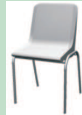
S1 white maga 8,11 €