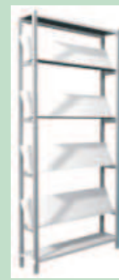
E7 group of Inclined shelves white