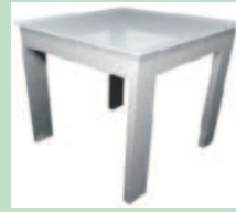
Me 22 table rincon cristal