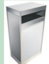
E3 counter tv white