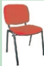
S4 Convencion red or black 28,19 €