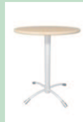
Me5 Mesa velador tonet haya/cromo 53,21 € - 0.60x1.12 m-

Prices valid for the entire event, including VAT